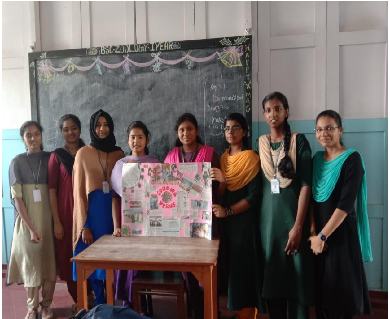
Covid -19 Awareness Programme in the campus before lockdown 2020 March