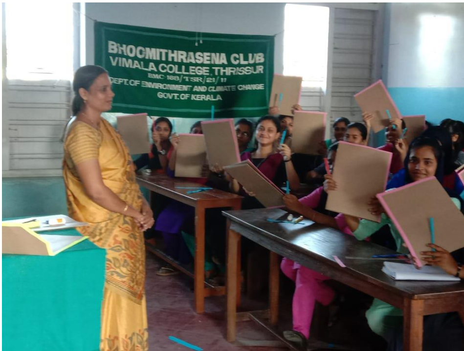
Paper File Making

A work shop was conducted on Paper file Making on 18 th September 2019. 33 students actively participated and prepared the files for their use.