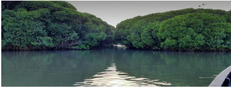
CHETTUVA MANGROVE FOREST ,THRISSUR

As a part of Wetland Day celebrations, a field visit was conducted by student representatives to Chettuva Wetlands of Thrissur district on 7 th Feb 2022( under covid protocol) . Water samples and sediments were collected for analysis.