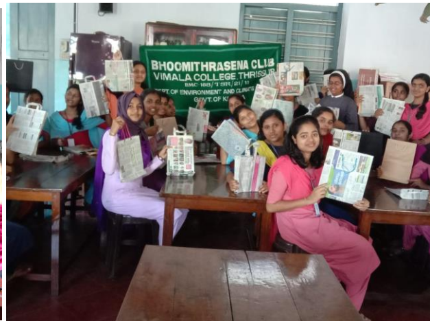
Paper Bag Making

A work shop was conducted on Paper file Making on 18 th September 2019. 33 students actively participated and prepared the files for their use.