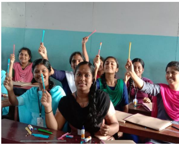
Paper Pen Making

A work shop was conducted on Paper Pen Making on 16 th September 2019. On the same day students were also trained to make paper covers too.